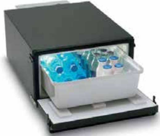
000536 BRK35 FRONT LOAD FRIDGE With Sliding Tray for Food INDENT