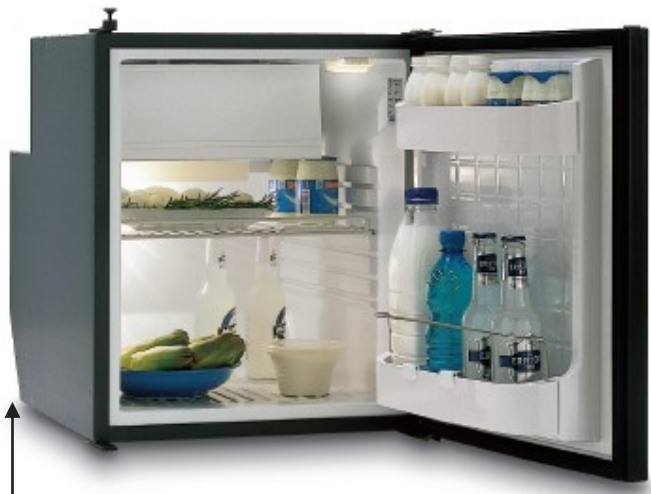
Specially Designed Angled Back