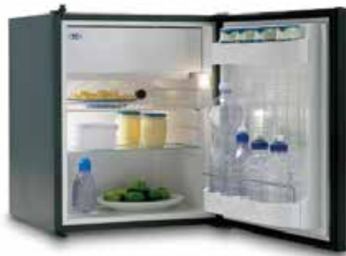
000560 C60IPF OCEAN FRONT LOADER Internal Compressor, 60L