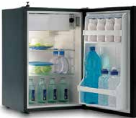
000558 C50I OCEAN FRONT LOADER Internal Compressor, 50L *INDENT*