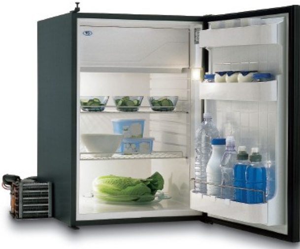
000540 C130LPFX OCEAN FRONT LOADER External Compressor, 133L