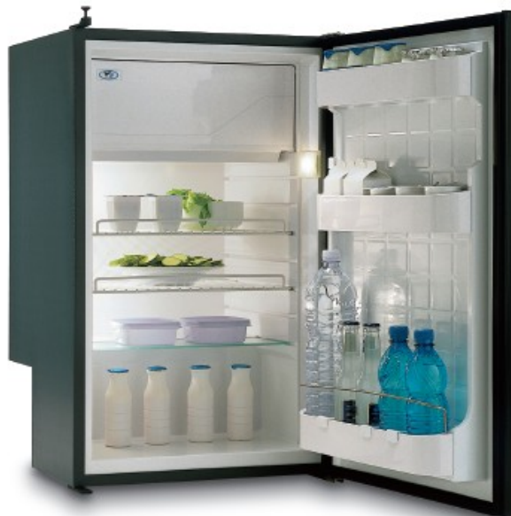
Vegetable tray not included