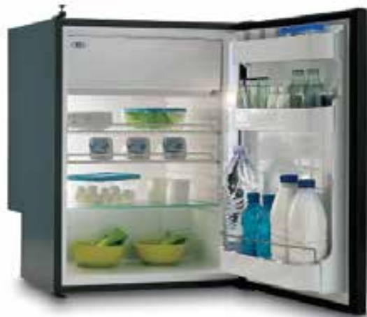
Vegetable tray not included