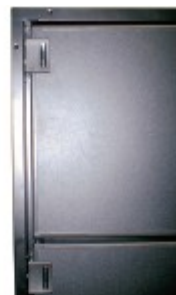
Vertical Nautical Catches Standard on DP2600

* Average Power Consumption, tested at 30°C Ambient Temperature