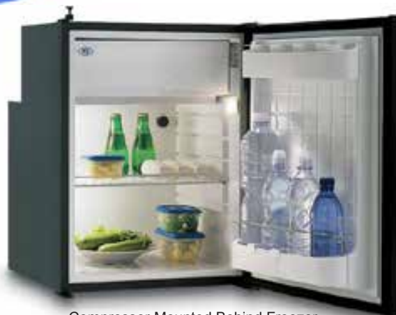
Compressor Mounted Behind Freezer Box At Top Of Refrigerator